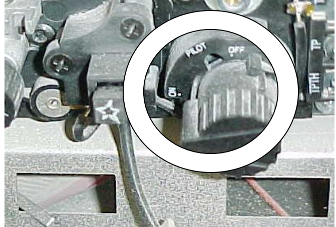
When the pilot light remains lit, turn the On/Off/Pilot knob to the "on" position.

Two types of ignitor buttons are shown here. You can test the ignitor buttons prior to turning on the pilot. You should see a blue spark in the fireplace (near the pilot gas supply orifice) each time the button is pressed. If you cannot see the spark, try turning off the lights in the room.