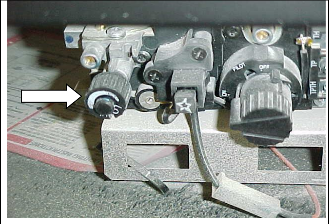
You can adjust the strength of the flame with a separate knob, it should have a high/low or other designation and is generally near the On/Off/Pilot knob.