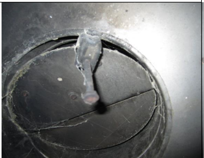
This shows a damper lock installed and the flue in a closed position; note the gap which will allow gas or other combustion byproducts to safely exit the firebox and up the flue.