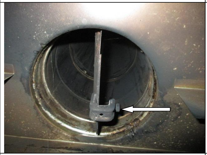
This shows a damper lock installed and the flue in the open position.