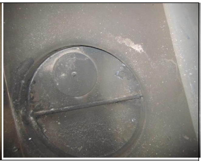
This shows a damper in the closed position. Flue gasses will not exit the firebox.