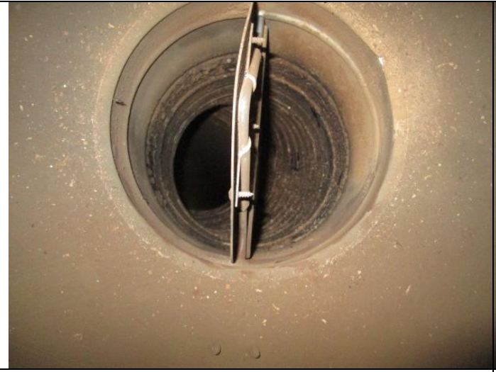
This shows a damper in the open position. Adequate ventilation for flue gasses.